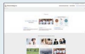
Corporate social responsibility (CSR) information