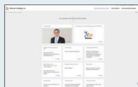
Corporate and Group information