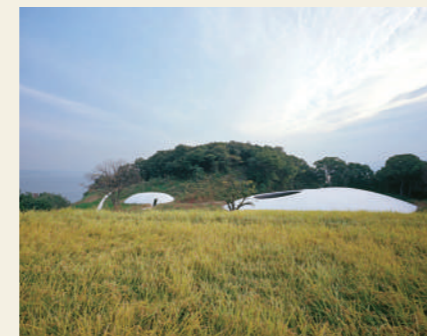
Teshima Art Museum