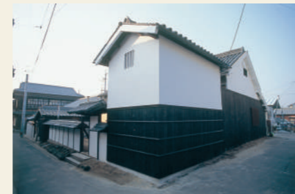
Kadoya art house project

The projects and activities of Benesse Art Site Naoshima have evolved into the Setouchi Triennale international contemporary art festival held by the local government and corporate companies. This three-yearly international art festival has been held four times since 2010. The fourth Triennale in 2019 attracted 1.17 million visitors, who viewed exhibits on 12 islands and in two ports in the Seto Inland Sea. In addition to sponsoring the event with partner companies, Benesse has been continually involved in the activities, including voluntary participation by employees, and the presentation of symposiums.