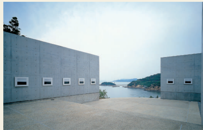
Time Exposed, by Hiroshi Sugimoto

Benesse Holdings, Inc., and the Fukutake Foundation have been working together for over 30 years to develop communities with a focus on art through projects and activities led by Benesse Art Site Naoshima.