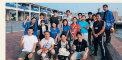
Employees who volunteered for Setouchi Triennale 2019