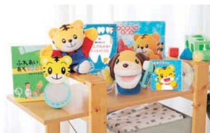
Kodomo Challenge (Preschool Courses)