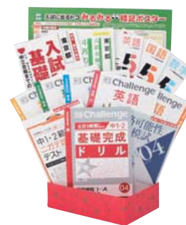
Junior High School Courses